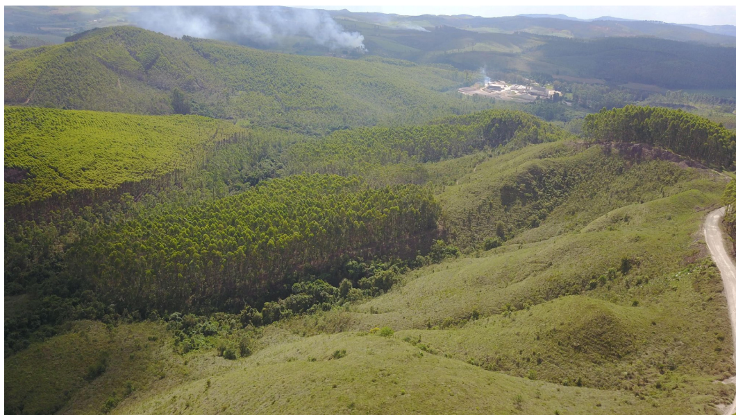
Figure 2. Aerial view of the sampled region, exemplifying the replacement of native vegetation by the monoculture of Eucalyptus spp. / Vista aérea de la región muestreada, ejemplificando el reemplazo de la vegetación nativa por el monocultivo de Eucalyptus spp.

Initially, this region suffered the impacts of mining and, in recent decades, it has been suffering the replacement of its natural matrices (Altitude Field) by large-scale Eucalyptus spp. reforestation (Santos M. et al. 2020). The following image shows these substitutions of natural matrices in the last decades (Fig. 2).